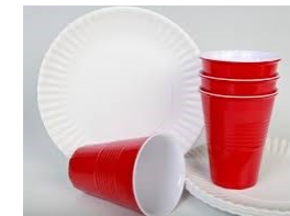
Plates, Cups, Utensils