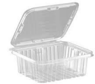
Clam Shells (fruits, takeout)