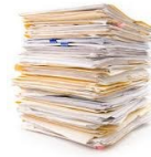
Office / School Papers