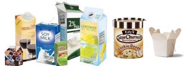
Wax Coated Drink and Food Containers