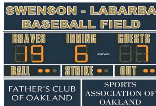
The new scoreboard will be located on field 8.

To learn more about recreation please visit their website at www.OaklandRec.org .