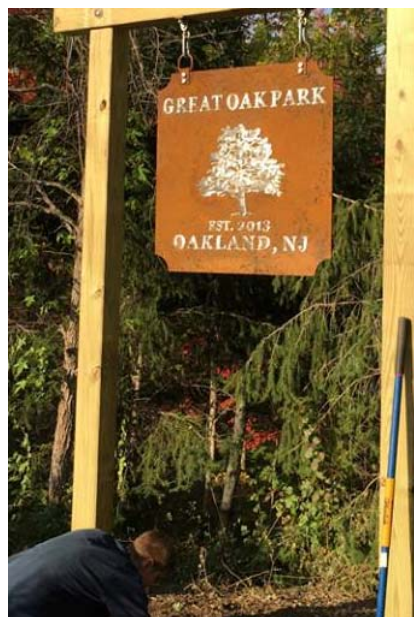
One of our local boy scouts putting the final touches on the sign located on the corner of Doty and RVR

Oak Park is located in about 85% of flood plain, has an important C-1 stream and home to wildlife. While we continue to develop we continue to