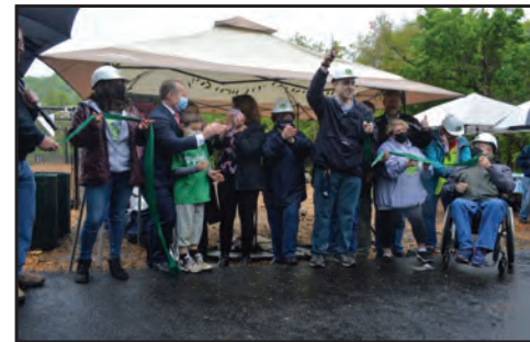
Borough of Oakland 1 Municipal Plaza Oakland, N.J. 07436