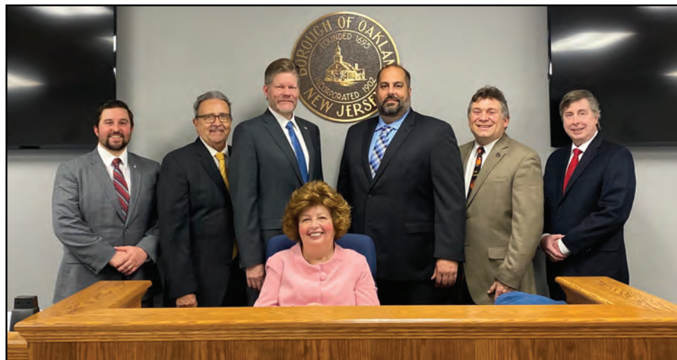
Mayor of Oakland